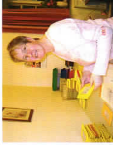
Sorting the returned wallets

Talking Newspaper cassettes are delivered weekly by post to our listeners in special reusable plastic wallets. After listening to the tapes they are posted back to us to be erased and used for the next week's recording.