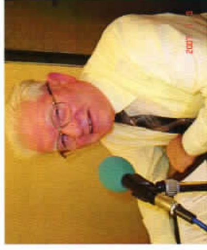
Recording in the studio

Nothing - it's FREE! There is no charge for the service and for people with a visual impairment there are no postage costs either.